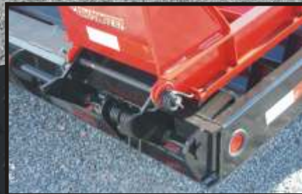
Two-way spring-assist is standard.