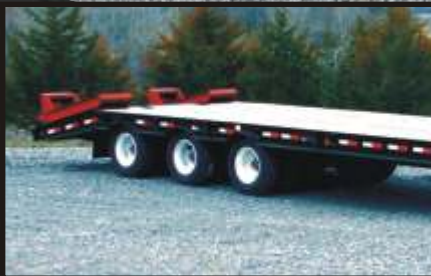
Optional triple axle available on the RG.