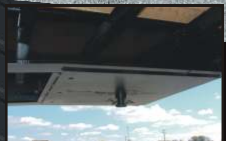
S.A.E. King Pin with smooth approach plate for easy hook-up.