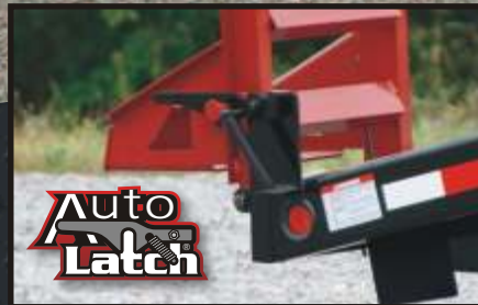
Equipped standard with our patented Auto-Latch ® ramp hold-ups.