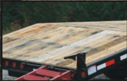
Wood topped beavertail comes standard on the Contrail ® Landscape Special.