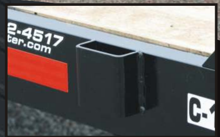
Stake pockets are included for tying down loads or adding sides.