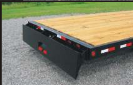
Patented automatic kick-out ramp doubles as under-ride protection.