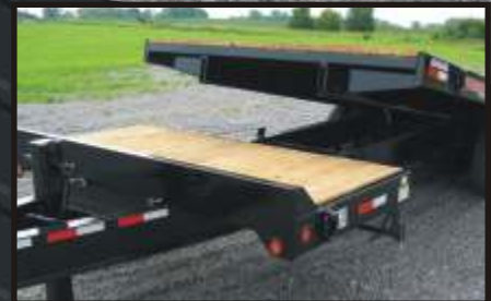
Stationary deck is standard on all deck-over tilt models.