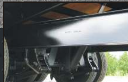
Deck cushion cylinder controls the deck while it closes while loading equipment.