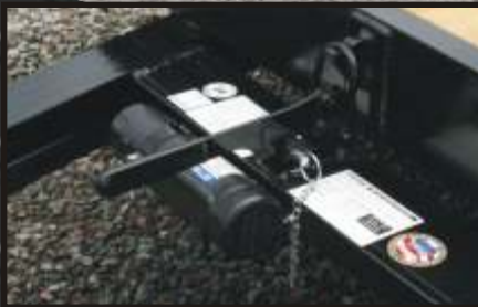
Positive locking (over-center) latch system keeps deck secured to the frame.