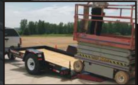
The T-5TSL includes the "SL" (Scissor Lift) option with ramps to lower the loading incline.