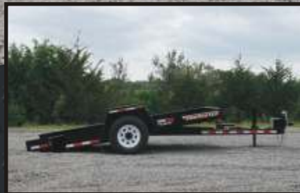
Low tilt angle to easily load small equipment.