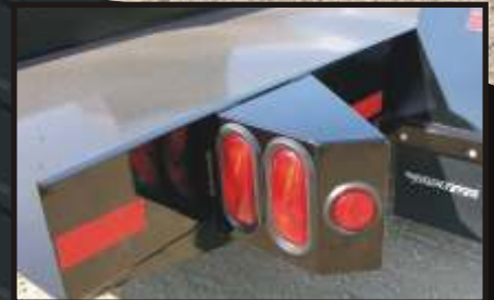
Shock-mounted lighting is standard on T-3T.