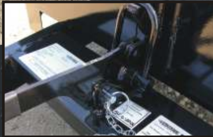
Positive locking (over-center) latch system keeps deck secured to the frame.