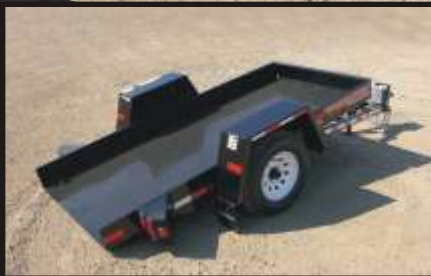
Slip-resistant coating on steel pan deck helps small equipment loading.