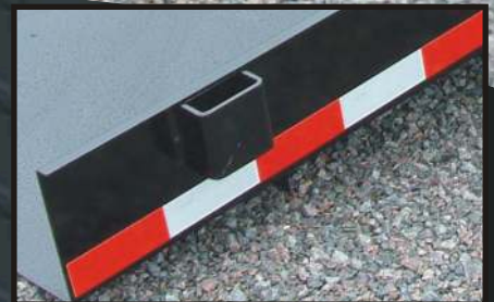
Stake pocket tie-downs located on each corner for load securement.