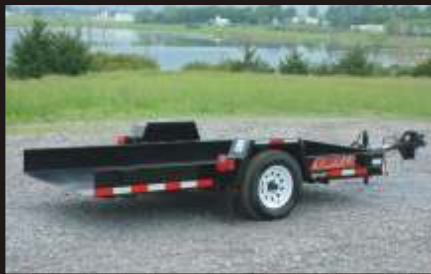
Low deck height makes loading small equipment easier.