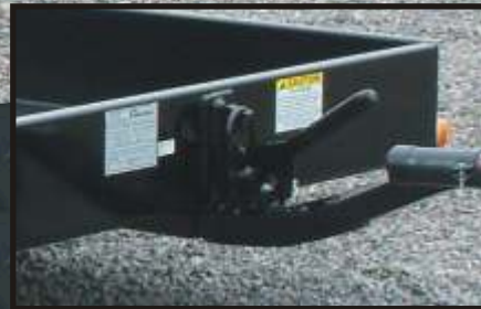
Positive locking (over-center) latch system keeps deck secured to the frame.