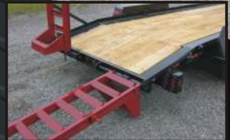
Optional low-angle 10-degree, 3-ft beavertail available.