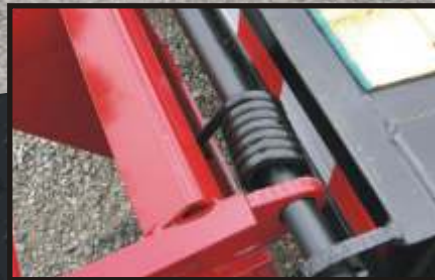
Spring-assist ramps help lift the ramps off the ground and into transport position.