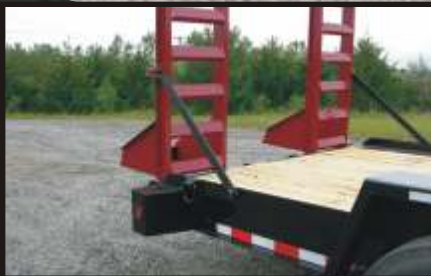
Solid ramp hold-up bars secure the ramps in transport position.