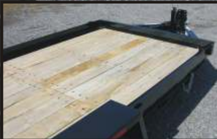
5" safety lip helps keep equipment in place.