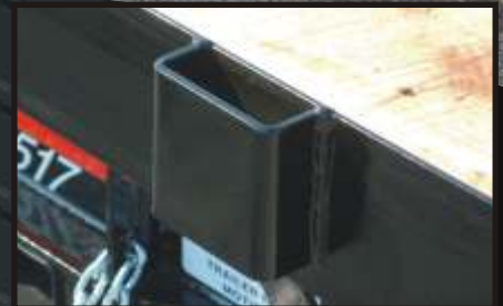
Stake pockets are included for tying down loads or adding sides.