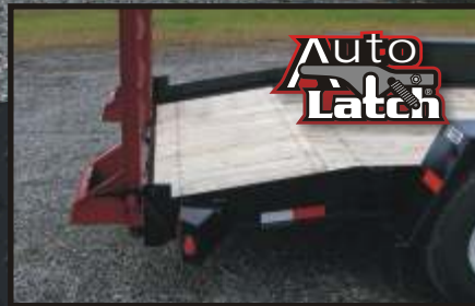
3-ft. beavertail for low loading angle, plus patented Auto-Latch ramp hold-ups are standard.